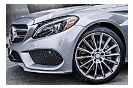
10 New Cars We Are Super Excited About Kelley Blue Book