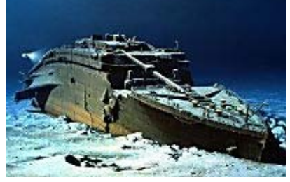
21 Underwater Discoveries Too Bizarre To Believe