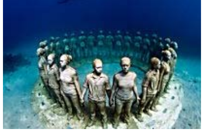
What They Found Hidden Below The Dark Ocean