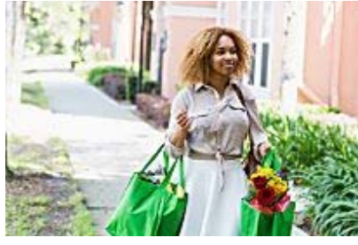
Here's How You Can Make 2016 Your Greenest Year Yet